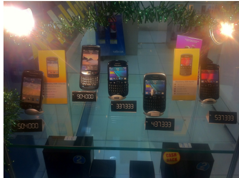
Images from a shopping mall in Surabaya: BlackBerry predominating and associated with cutting-edge devices. The rupiah exchanges for approximately 1 US$ = 9,500 Indonesian rupiah.