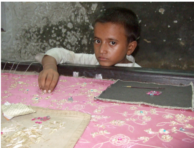
fig 1. A six year old child is seen working on a bridal dress. He is paid around Rs 50 ($1.04) per week.

With the end of the feudal era the demand for this type of embroidery fell but it has continued to remain a part of the Shia culture of Lucknow. During the last three decades one has witnessed a resurgence in the production of Zardozi embroidered clothes after their induction as ethnic couture in the bridal wear, fashion and glamour industry of India and abroad. This has created a huge local demand and an export boom to the Middle East and Europe, along with creating an extraordinary inclination within the Muslim community towards learning this art from their predecessors. The migration of Zardoz from Lucknow to Saudi Arabia and Dubai has also been a common phenomenon since then.